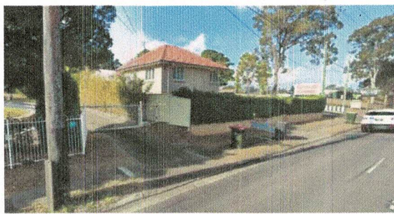
Under the plan, the depicted residential house at 55 Klumpp Rd would be demolished to expand the Perfect Beginnings childcare centre located behind it at 53 Klumpp Rd.

“There’s already close to 50 people on the waitlist for February, and we only have 58 spaces, so we aren’t meeting everyone’s needs.”